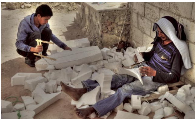
Team members carving capitals out of polystyrene for the “faux restoration”

The second new project subcomponent to become active in 2013 was related to developing the final Presentation Strategy. The TWLCRM Team met in autumn 2012 to decide on the minimal extent of restoration ( anastylosis ) which would be needed to meet all of the Presentation Strategy goals, such as the structural needs of the building, as well as the educational/didactic, aesthetic, and environmental impacts. The decision was made to restore a small cluster of five of the original first-storey columns in the Cella to an approximation of their original heights with the appropriate capitals. Two columns from the West Colonnade were selected which would be crowned with original Nabataean-Corinthian capitals and three columns on the northwest corner of the Cultic Podium