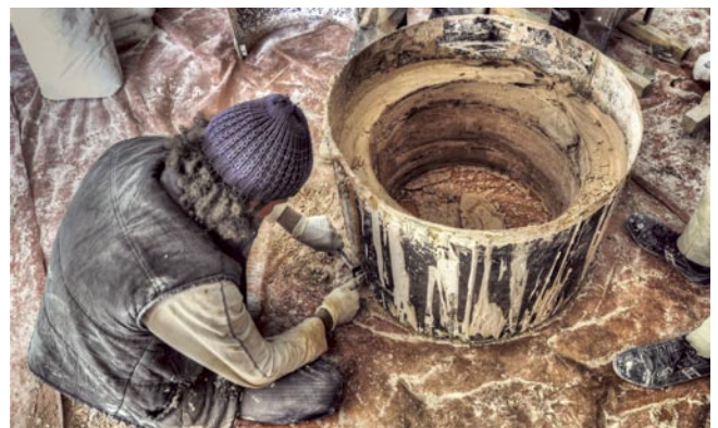
Casting of the plaster drums for the “faux restoration” of the columns