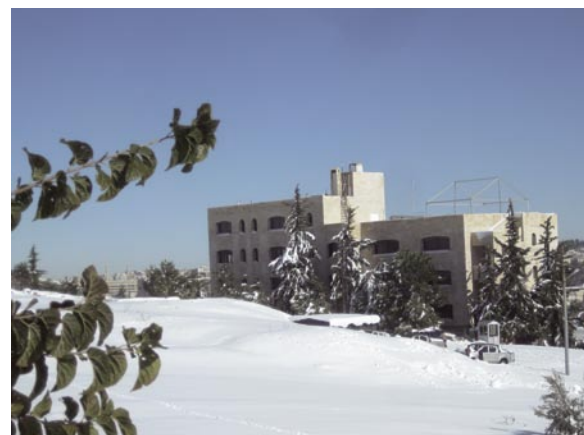
ACOR snowed in after the major December 2013 storm