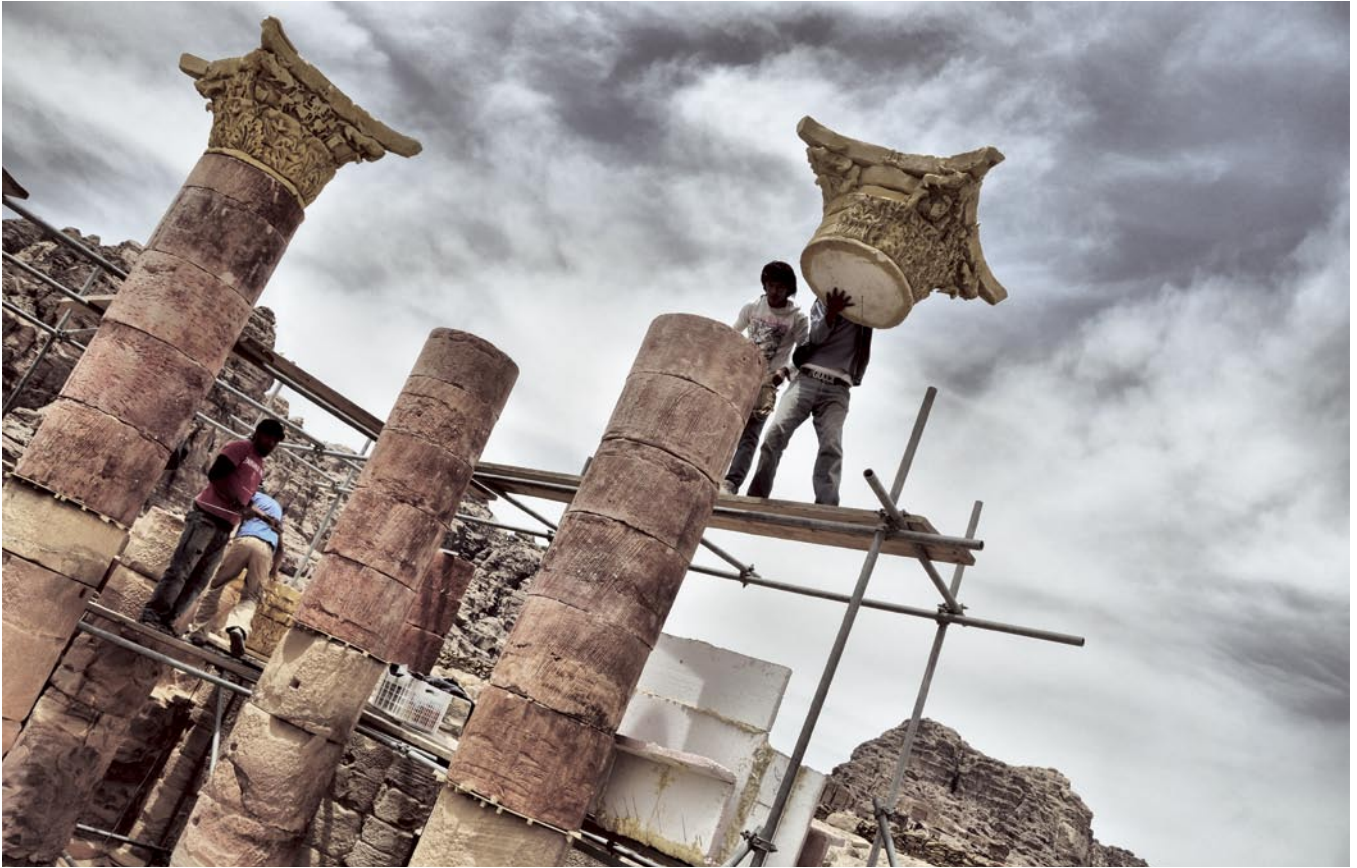
Assembling the lightweight “faux restoration” columns; image by Qais Tweissi awarded Grand Prize in the World Monuments Fund 2013 photo contest

The focus of this first two month campaign was the interior face of the North Wall of the Temple Cella. This wall was determined by Danielli and the rest of the TWLCRM team to be a priority due to its advanced state of degradation. During a nine-week period (March–May), the Conservation Team cleaned the wall of the detritus that had accumulated since the original 1970s excavation, removed salts, stabilized the flaking and scaling stone surfaces, sealed cracks, conserved a few in situ examples of original plasters, and treated all surfaces with consolidants. They also installed deep hydraulic mortars which serve to prevent water from percolating between the ashlar, increase the wall’s overall stability, and add an absorption layer that helps reduce the efflorescence of damaging salts on the building stones themselves. Finishing mortars were then emplaced using a sculpting technique that helped integrate the new work aesthetically into the visual integrity of the extant original