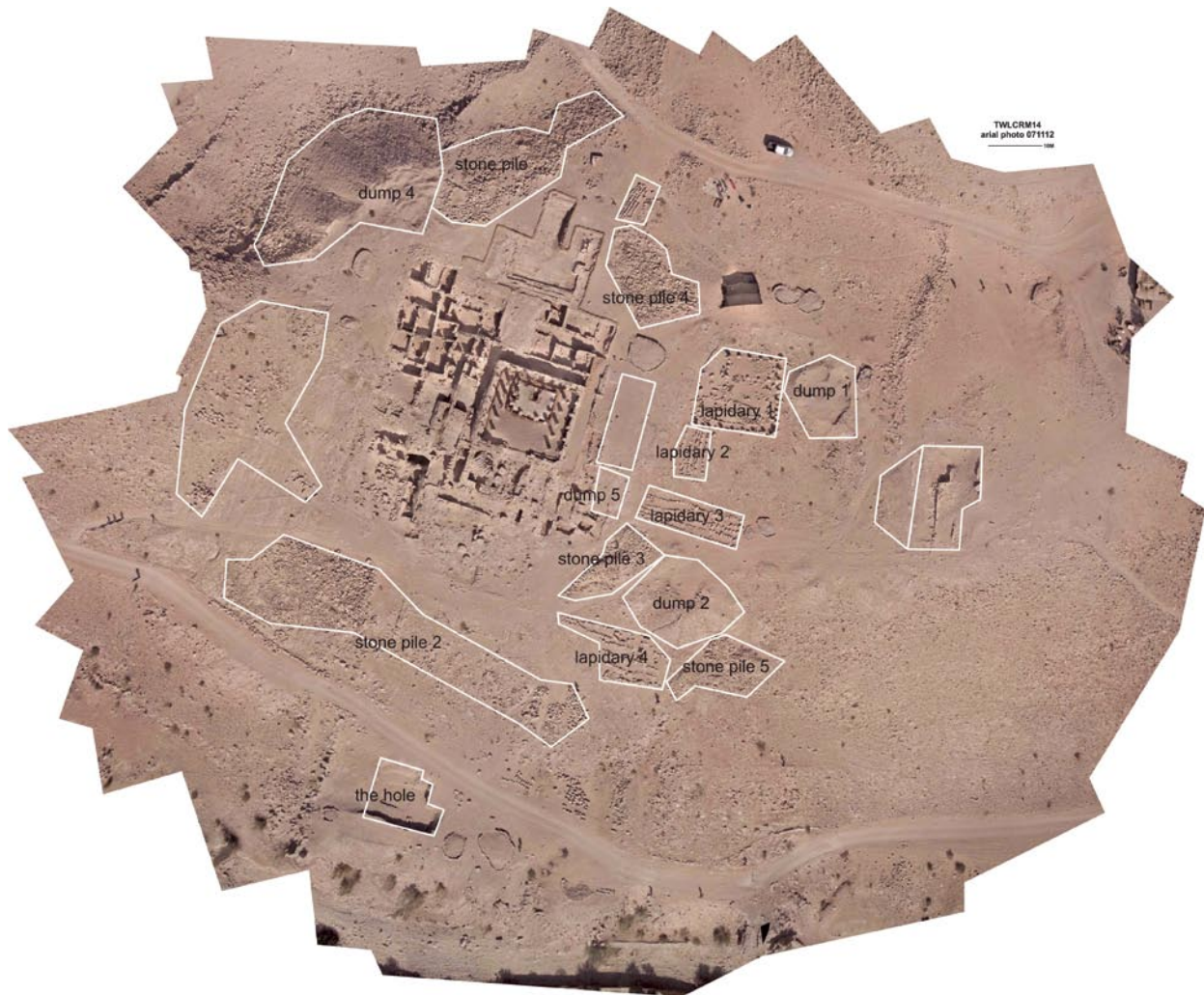
Site plan of TWLCRM work zone outlined on a composite aerial photograph from the balloon photography collaboration with the University of California, San Diego in November 2012 (see ACOR Newsletter 24.2 for the story and full photo credit)