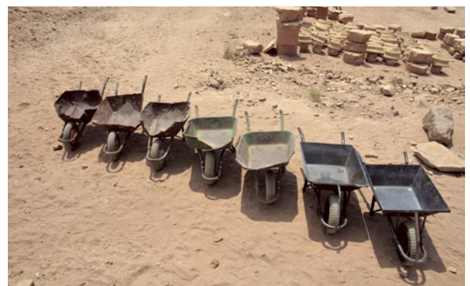
Typology of wheelbarrows awarded first place in the 2013 Archaeological Institute of America photo contest