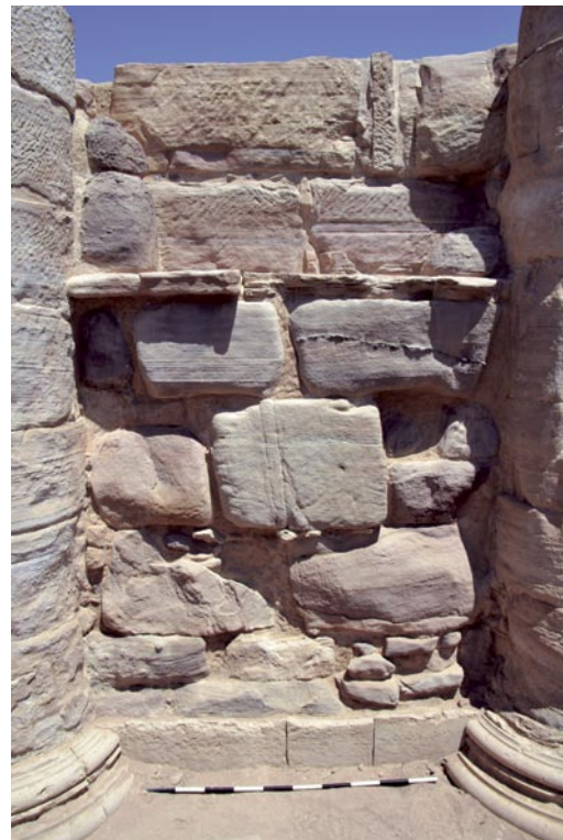
Section of the interior face of the Temple North Wall upon completion of the first conservation campaign

circumstances found inside the TWL precinct after testing. All interventions were planned based on internationally accepted best practices along with the specific contexts of the construction materials and techniques employed in Petra.