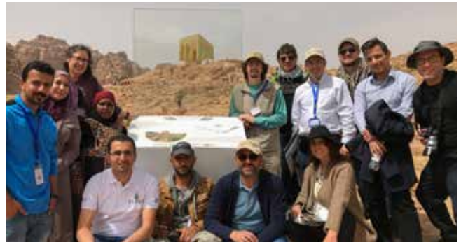
Representatives from TWLCRM, SCHEP, ACOR, PDTRA, and DOA at the new augmented reality sign for the Temple of the Winged Lions placed on the Colonnaded Street in Petra city center, March 2018

In mid-May in Wadi Rum, CB-RAER, the Community Based Rock Art and Epigraphic Recording Project, celebrated the completion of its Rock Art Rangers program with a series of presentations and recognition of the contributions of team members. Over the