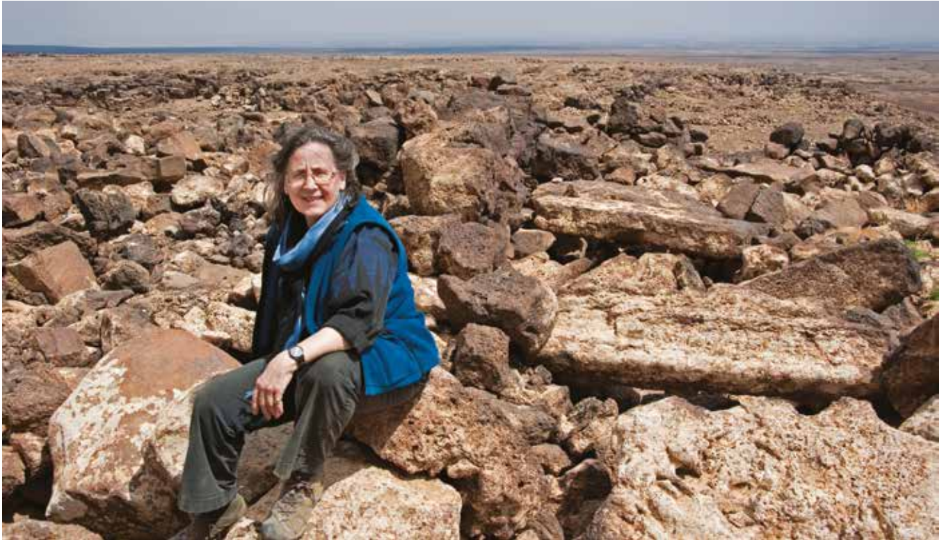
Visits to sites around Jordan have brought special opportunities as here at Jawa in the northeastern Badia in April 2011.

*ACOR newsletters will be referenced here by volume number and can be readily found on the ACOR website www.acorjordan.org under Publications.