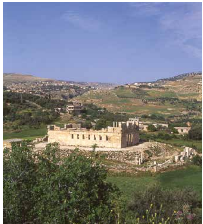
The Hellenistic-period palace at Iraq al Amir as documented in 1998