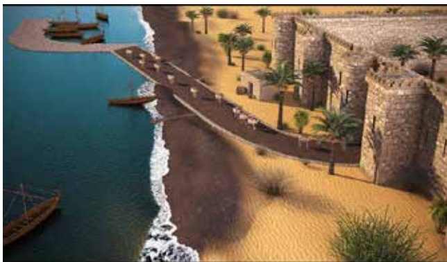
Virtual Reconstruction of Islamic Ayla, including the Sea Pier and Sea Gate

A key outcome of SCHEP is to help preserve cultural heritage sites as well as make them more accessible to tourist visitors and members of local communities. Site pathways were completed and interpretative signage was installed at sites, such as Ghawr as-Safi, the Temple of the Winged Lions at Petra, and Umm al-Jimal. In addition, site preparations and collections documentation were conducted as part of MRAMP, the Madaba Regional Archaeological Museum Project.