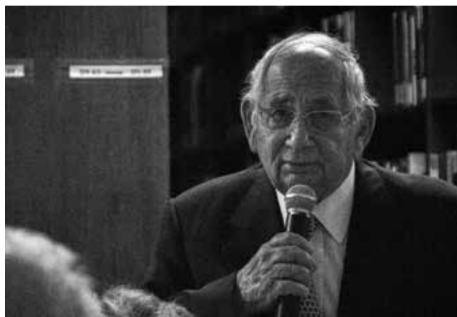
H.R.H. Prince Raad Bin Zeid gives remarks at the January 10 dinner.

In the first half of 2018, ACOR held two celebratory events in Amman to mark the occasion of our 50 th Anniversary with many of our supporters and friends. On January 10, we held an intimate dinner in the ACOR Library, during which we celebrated H.R.H. Prince Raad Bin Zeid on the occasion of his retirement from the ACOR Board after more than 30 years. H.R.H. Prince Raad remains a valued friend of ACOR, and over the decades of his patronage he has witnessed our institution grow and change to become what we are today.