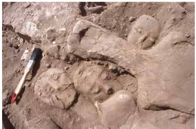
Neolithic statues being unearthed at Ayn Ghazal in 1983