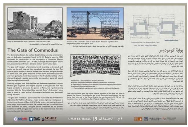
Commodus Gate signage panel (design by Open Hand Studios)

the inscription, were carried north across the border for reuse in the village of Umm ar-Romman in Syria. Just about all remaining wall stumps were slumping so badly that the only option was to dismantle and rebuild them. Thus the whole structure, including the adjoining Byzantine West Church yard gate, was dismantled and rebuilt in the allotted three weeks.