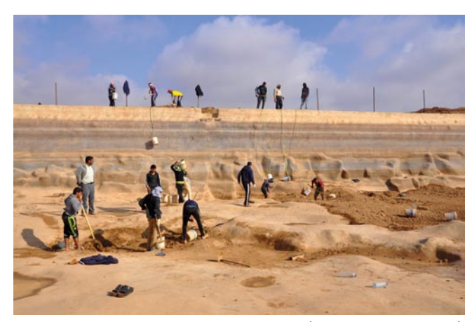
Silt and stone removal from the Roman reservoir

water supply seemed irrelevant after the discovery of the deep-well aquifer in the 1990s, it is once again becoming essential, as that aquifer is being pumped to depletion.