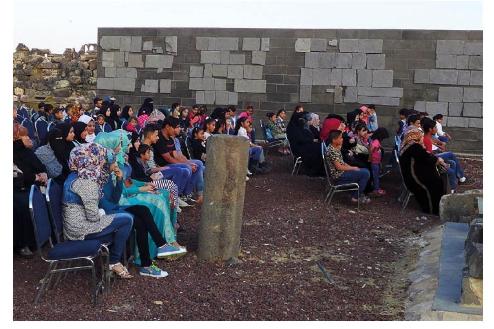
House 119 Courtyard Graduation Celebration with Anastasios Decree replica in the background

The Decree of Emperor Anastasios (A.D. 491–518) written in Greek included more than 300 lines of text related to the military organization of the eastern border of the Byzantine Empire. The blocks uncovered at Qasr Hallabat displayed in a lapidarium at that site museum are considered to have come originally from Umm el-Jimal, where some blocks still exist.