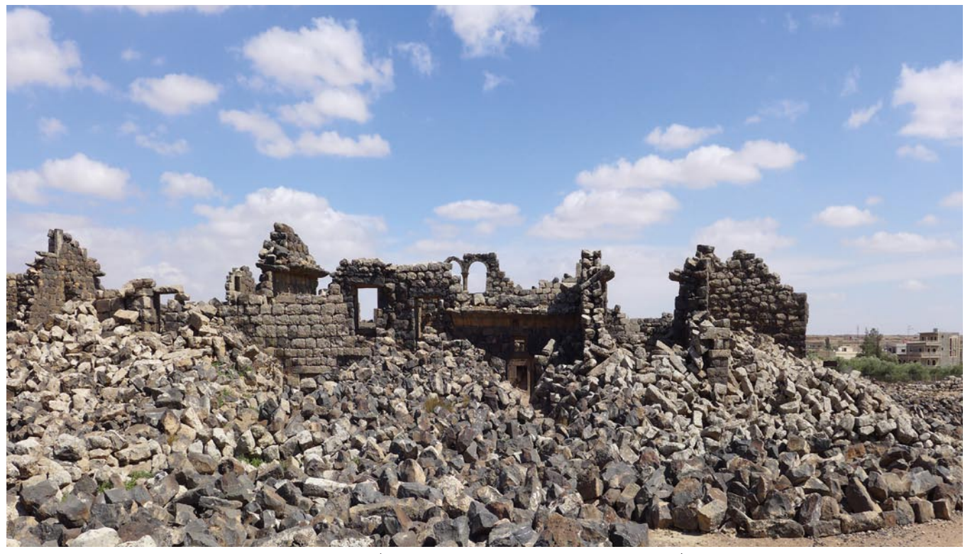
Umm el-Jimal House XVII-XVIII: Preserving a ruin as a ruin

The Calvin College Umm el-Jimal Project (UJP) conducted a series of traditional field seasons of mapping and excavation from the 1970s to the 1990s, from which we learned the nature of the succession of Umm el-Jimal from Nabataean to modern. From 2007 on, the UJP has turned to site conservation and presentation, using tools and strategies not available to us decades ago.