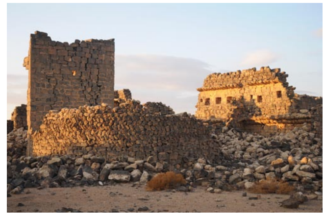
Upper stories of Byzantine houses

As we planned our new agenda, key terms were "digital" and "inclusion." These were linked in our minds, because both enable the goal of conserving the site to be enjoyed well into the future. "Digital preservation" captures the state of a site at a given moment before its further decay. "Inclusion" of the community makes local residents stakeholders in caring for the antiquities and the prevention of looting and vandalism. Thus, "digital" and "inclusion" are the twin pillars of our site conservation and presentation agenda.