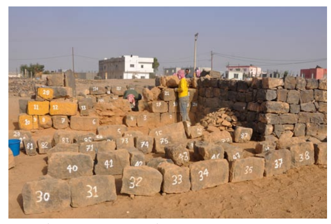
Commodus Gate conservation work in progress